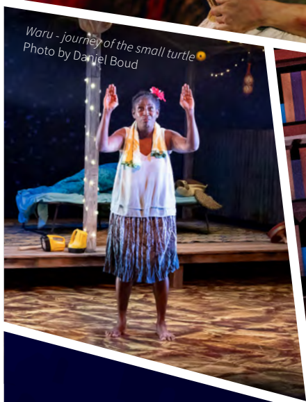
Waru - journey of the small turtle