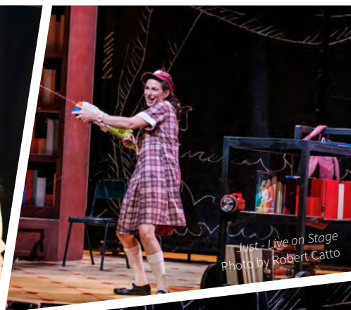
Just - Live on Stage