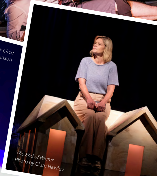
The End of Winter