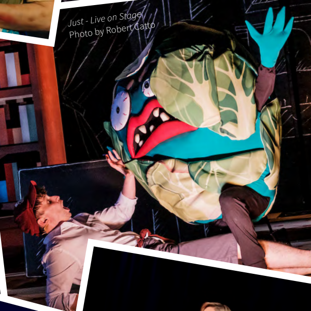
Just - Live on Stage