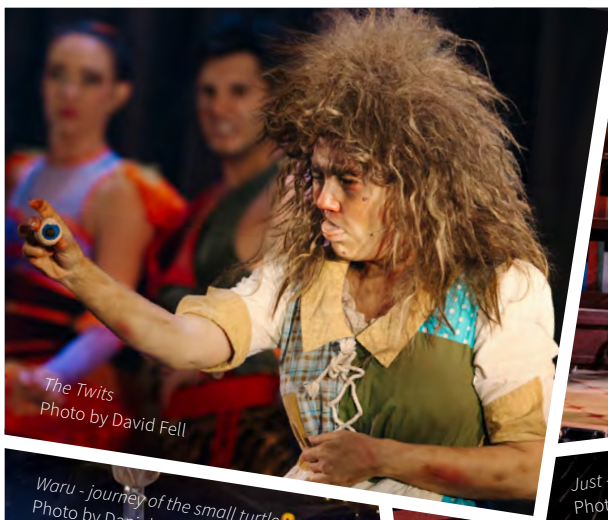
The Twits