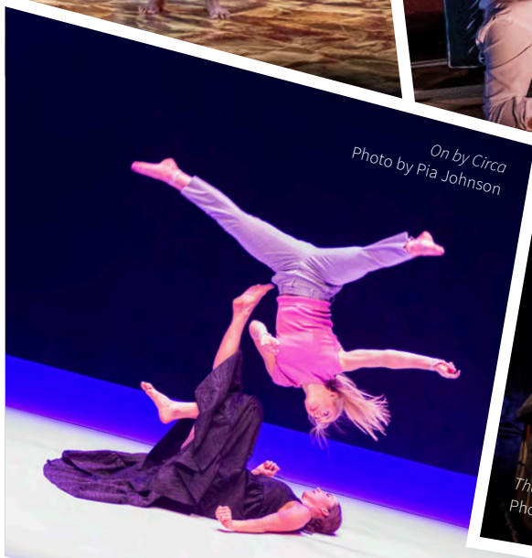
On by Circa